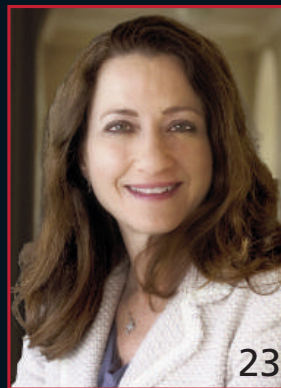
CLAUDETTE BERWIN GALLERY PROPERTIES